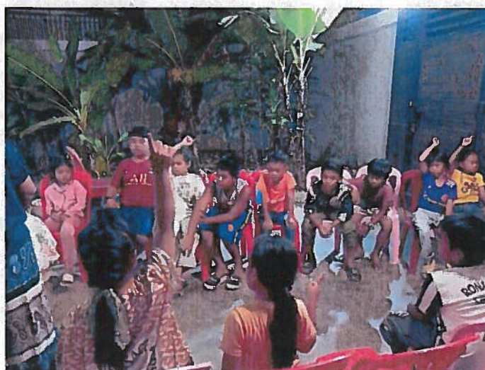
Outreach at Our House