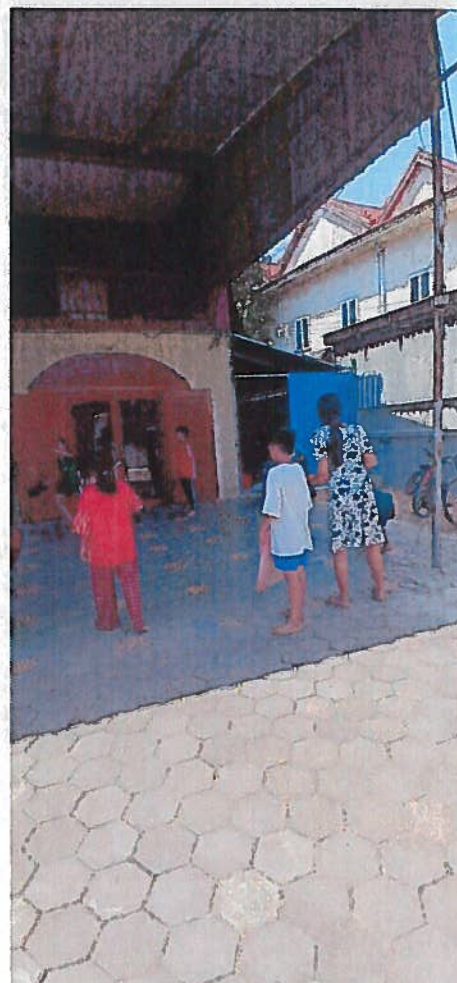
New Church Facilities