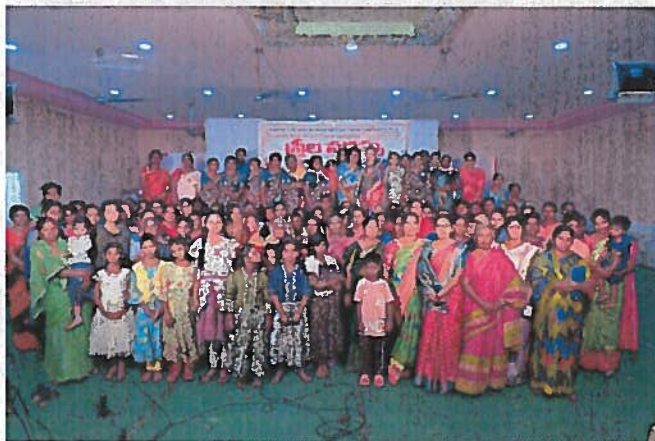
Ladies' Conference in India